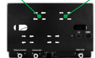
CONFIGURATION 2 Ceramic filter CONFIGURATION 1 Ceramic filter